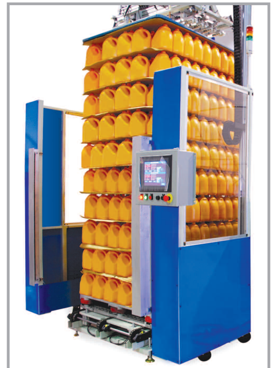
Pallet In-feed & Exit Chain Conveyor