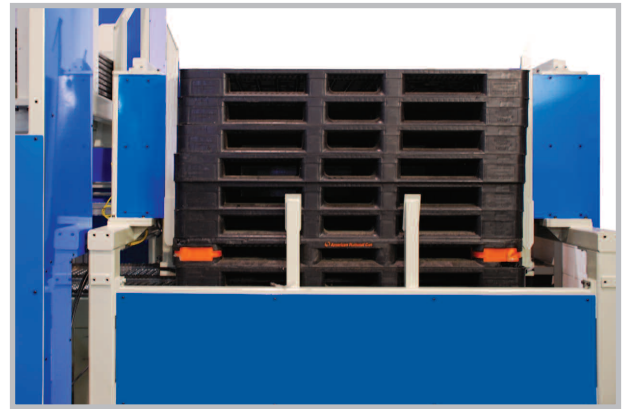
Pallet Feed Magazine